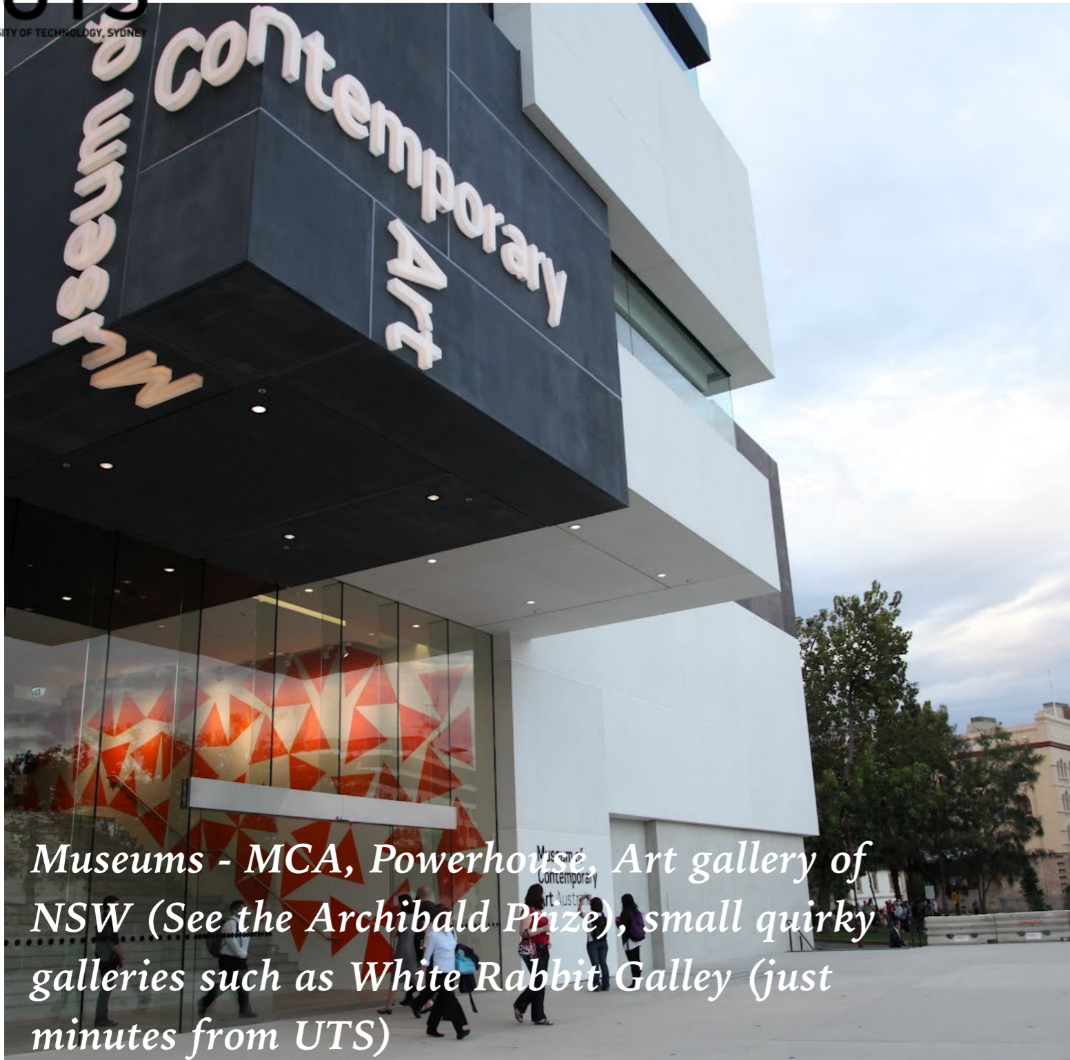
Museums - MCA, Powerhouse, Art gallery of NSW (See the Archibald Prize), small quirky galleries such as White Rabbit Galley (just minutes from UTS)