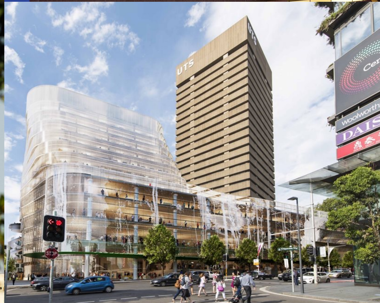
UTS UTS Tower Building CRICOS Provider Code 00099H