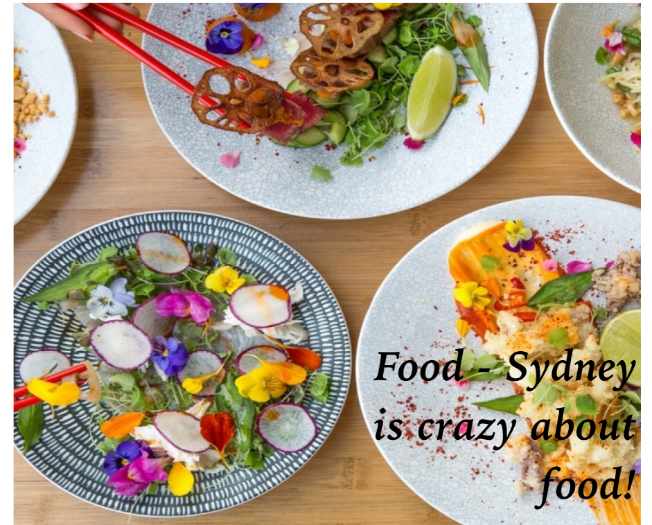
Food - Sydney is crazy about food!