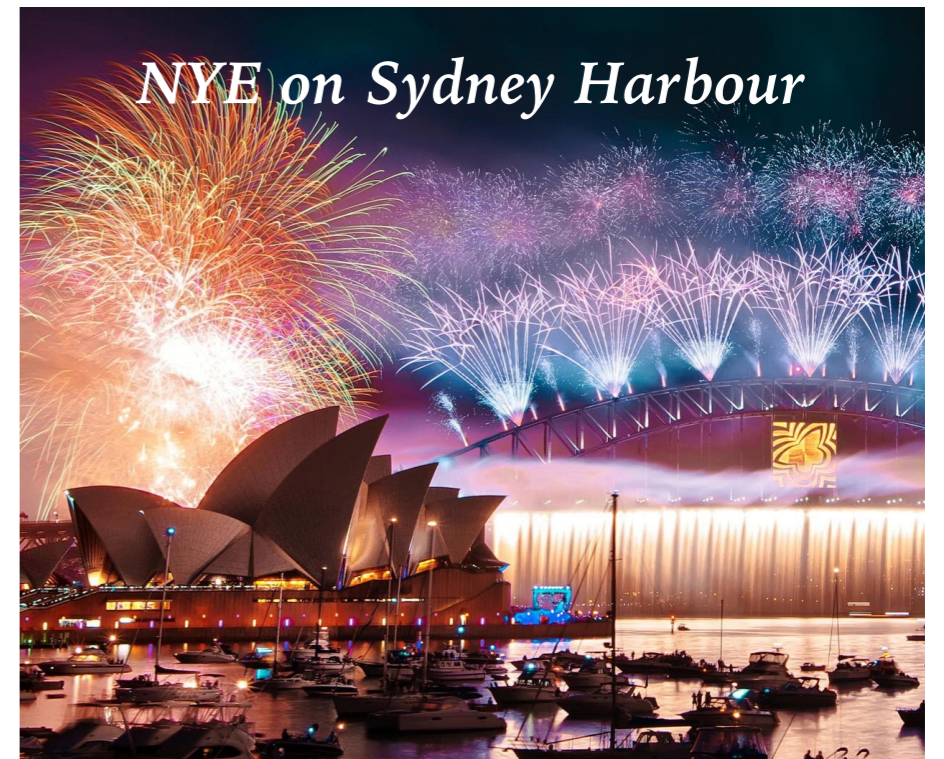
NYE on Sydney Harbour