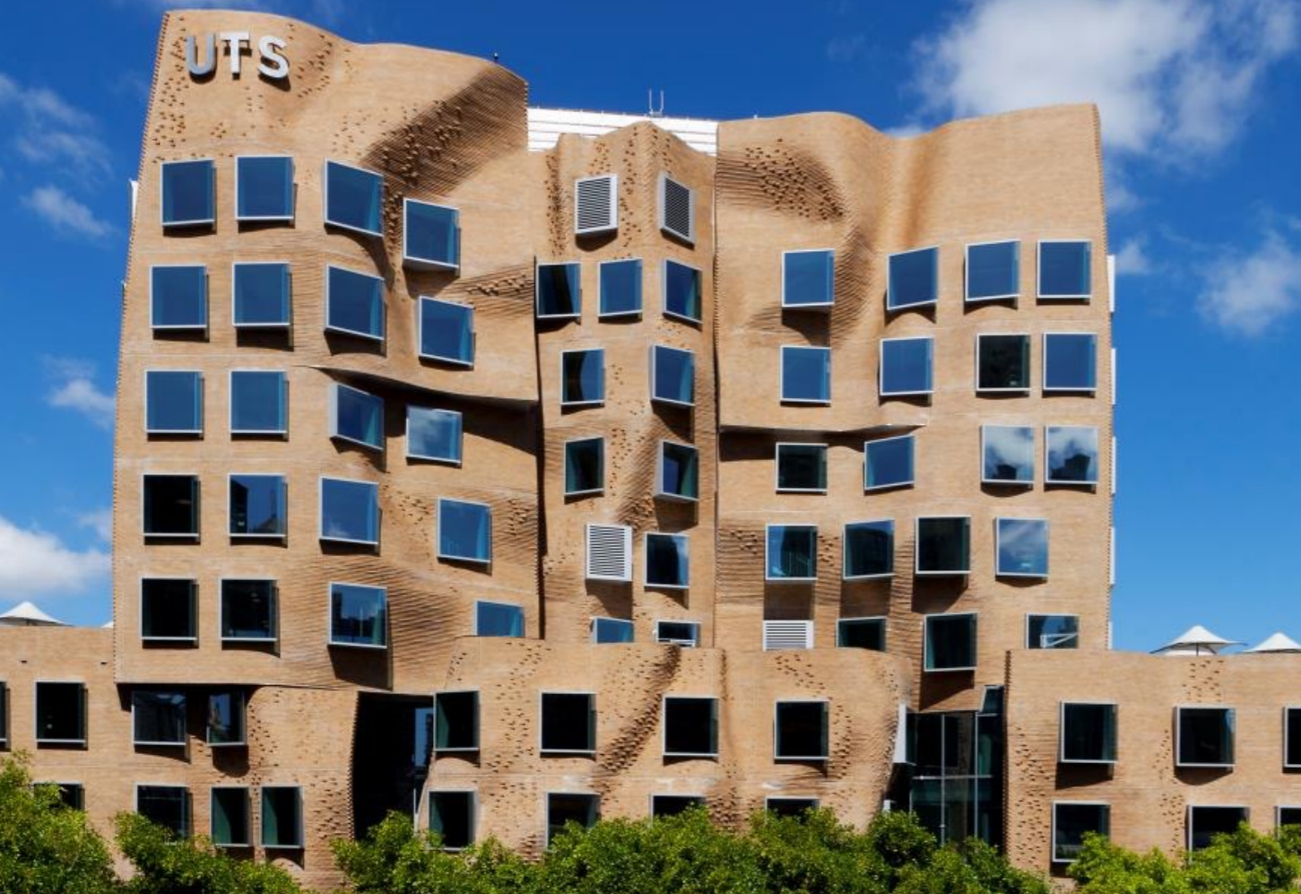
Dr. Chau Chak Wing Building