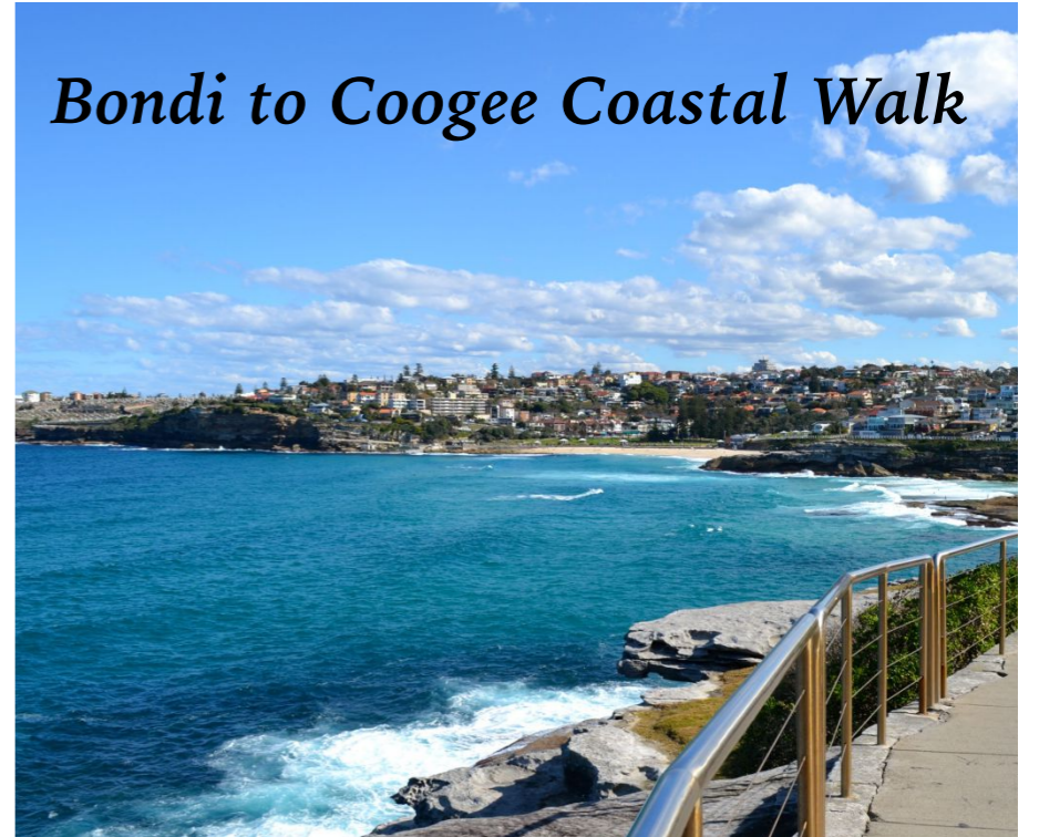
Bondi to Coogee Coastal Walk