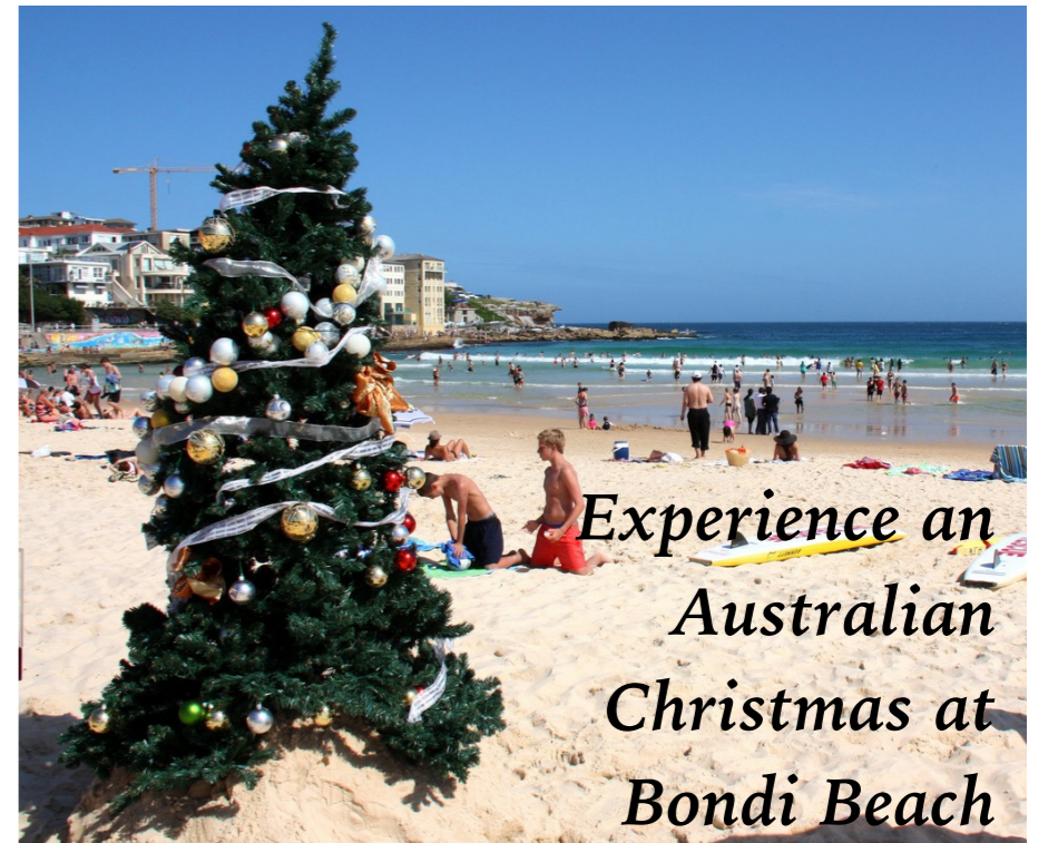
Experience an Australian Christmas at Bondi Beach

OTHER THAN THE BEACHES, WHY ELSE SHOULD I STUDY IN SYDNEY?