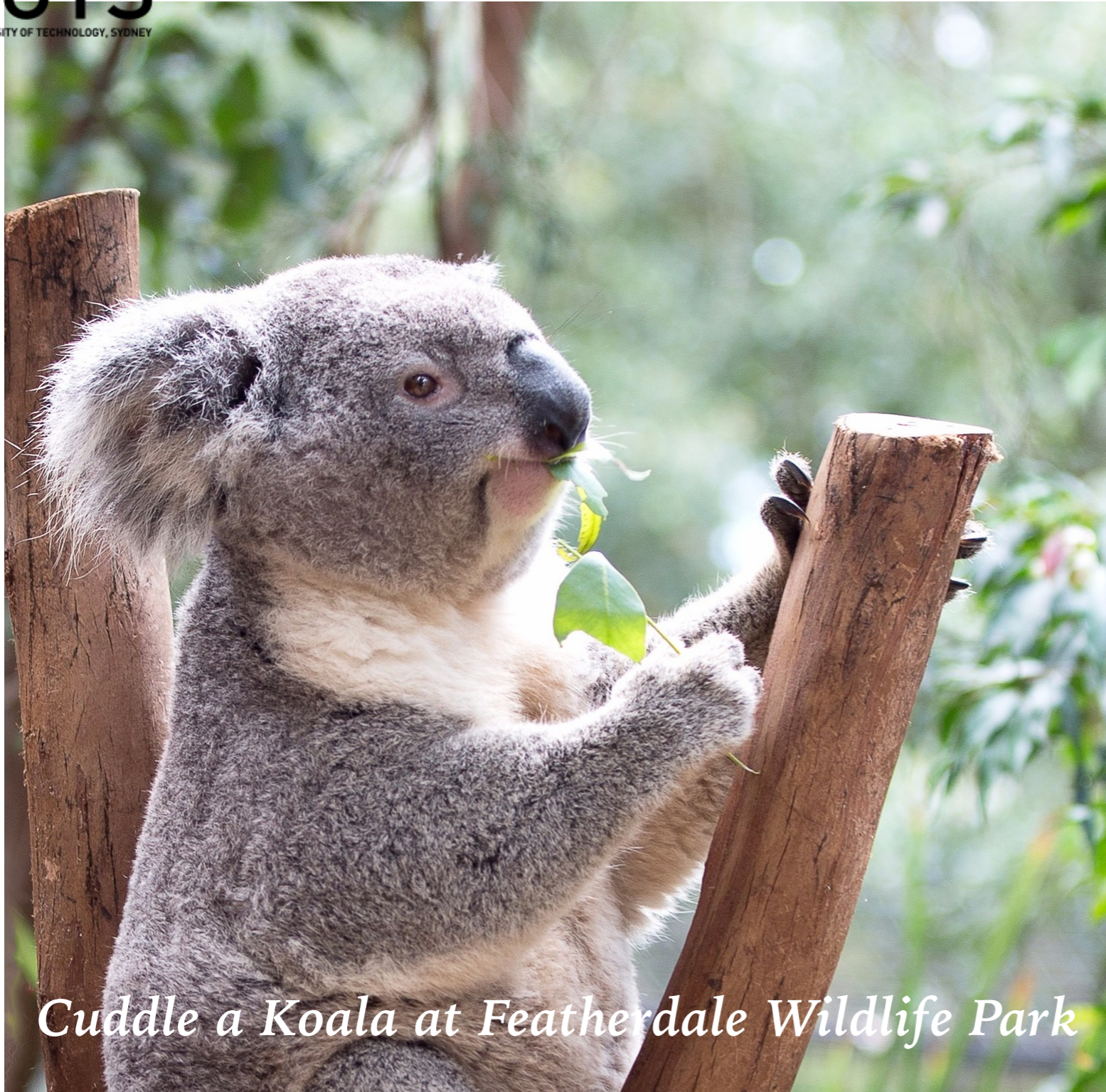
Cuddle a Koala at Featherdale Wildlife Park