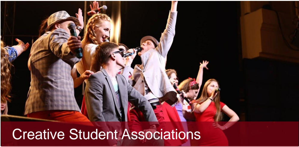
Creative Student Associations