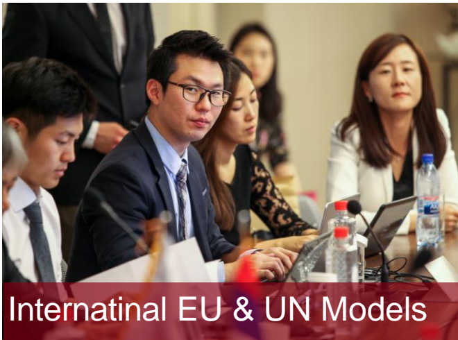
Internatinal EU & UN Models