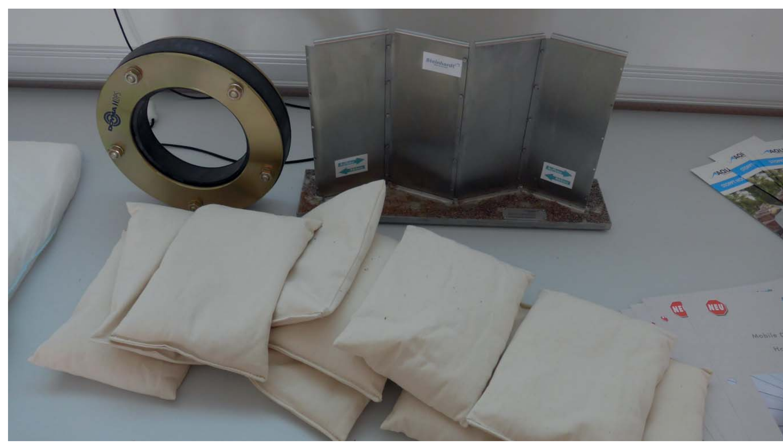
Figure 3. Choice of illustrative material used during the workshop. (K. Brewitt)

Six workshops were held in different municipalities in the German federal states of Saxony, Saxony-Anhalt, Hamburg and Berlin. A flood expert and a researcher led the interactive workshops. Topics ranged from behavioural precaution to property protection (fig. 3). 115 participants filled in the pre-post questionnaires.