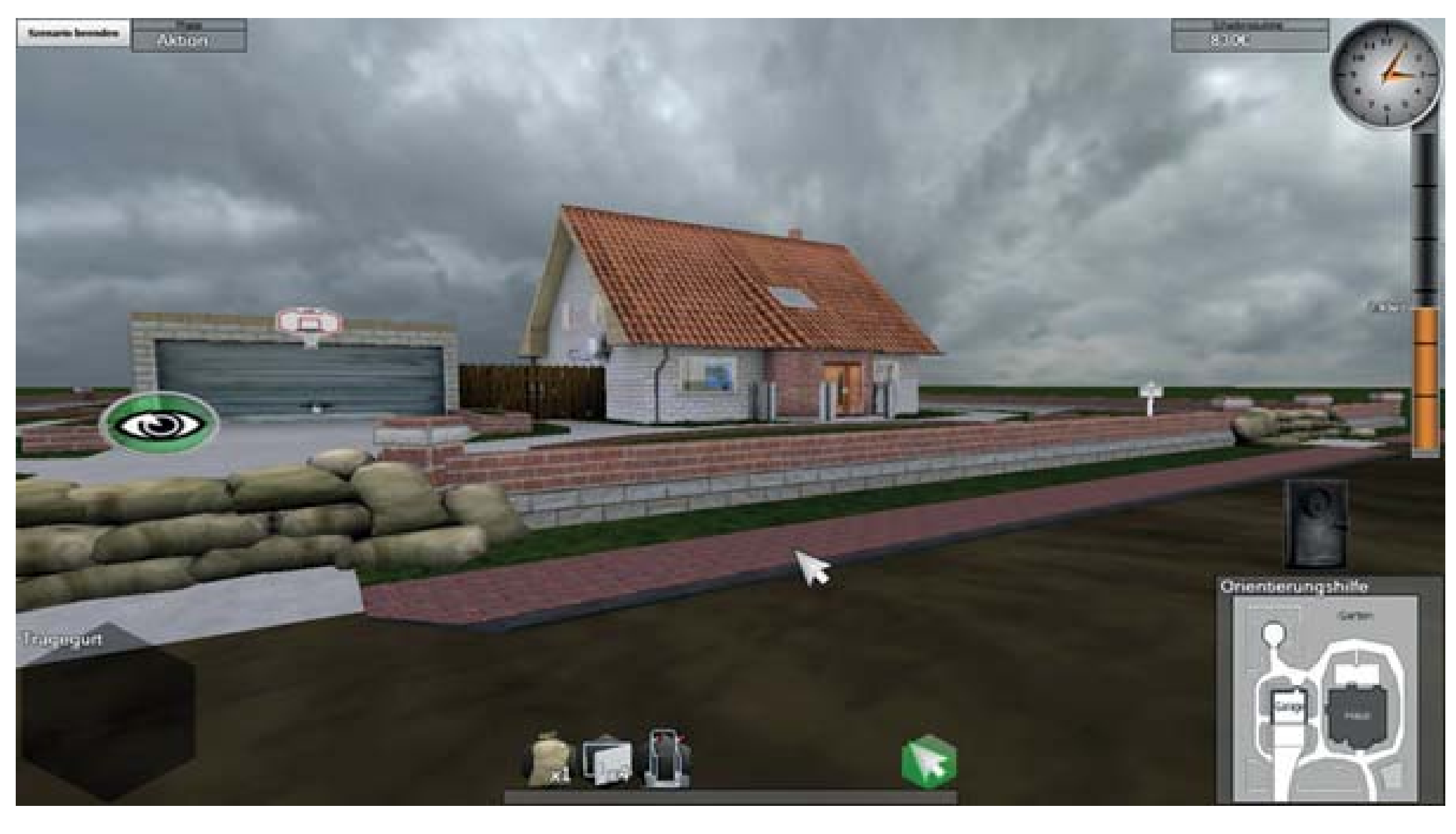
Figure 1. Scene from the serious game SchaVis. (Midtrigger GbR, www.mindtrigger.de)

The game was tested in two experiments: Experiment 1 (01-03 2017) was carried out in Magdeburg (238,000 inhabitants), a city located at the river Elbe in Saxony-Anhalt. The 121 participants were randomly assigned to one of three groups: one group played the serious game SchaVIS (fig. 1) while a second used a flood map and a third used a leisure map (control 1, map). Experiment 2 (03-06 2018, n = 60) took place in Regensburg (Danube), Lüneburg (Elbe) and Potsdam. Participants either played the flood game or a leisure game (control 2, game).