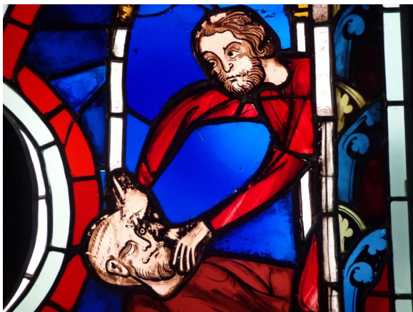
The Blinding of Samson, stained glass window of the Sainte Chapelle, ca. 1245 – Musée de Cluny, Musée National du Moyen Âge, Paris.