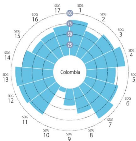
▼ AVERAGE PERFORMANCE BY SDG

Here you can find documents about the performance regarding the SDG from Colombia and Germany, the current Challenges and efforts to overcome (links to full PDF-report).