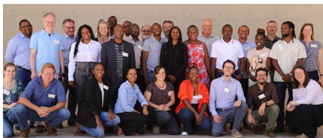
Fig. 2: The NamTip project team meeting with Namibian stakeholders and practitioners (Windhoek, March 2024).