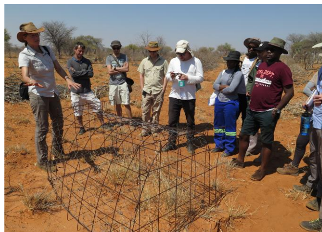
Fig. 3: Discussions between researchers and stakeholders during a joint field trip to the experimental sites (Okakarara, October 2022).