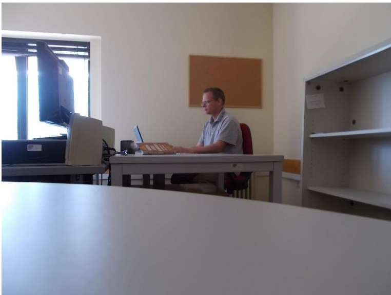
At work in the office