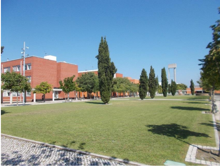
University of Aveiro Campus.