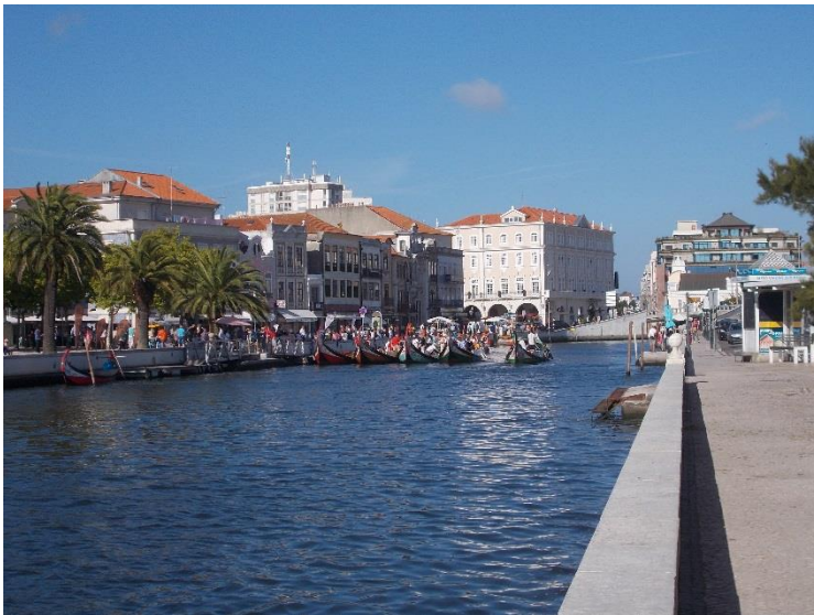
Numerous, picturesque channels of the city