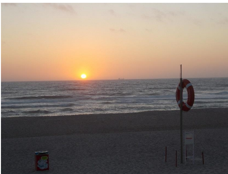
Sunset over the ocean, just 10 km from Aveiro