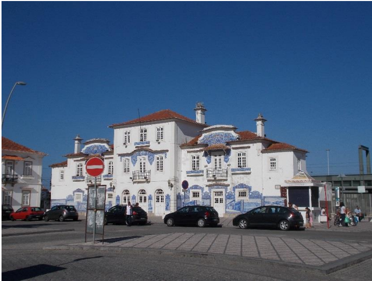
Old railway station with azulejos