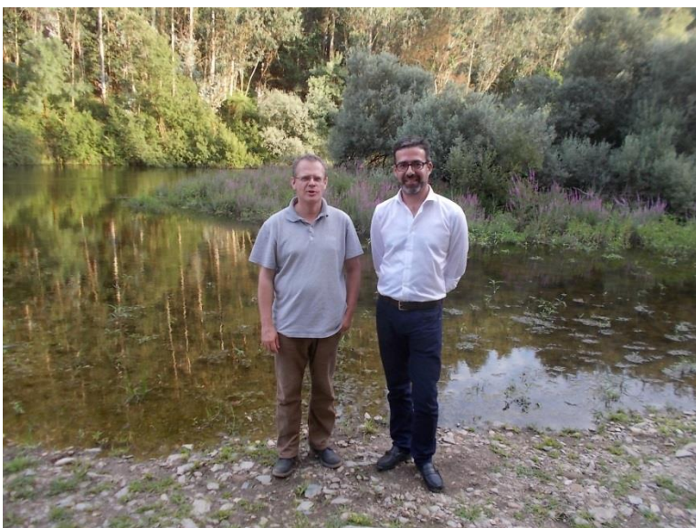
in leisure time