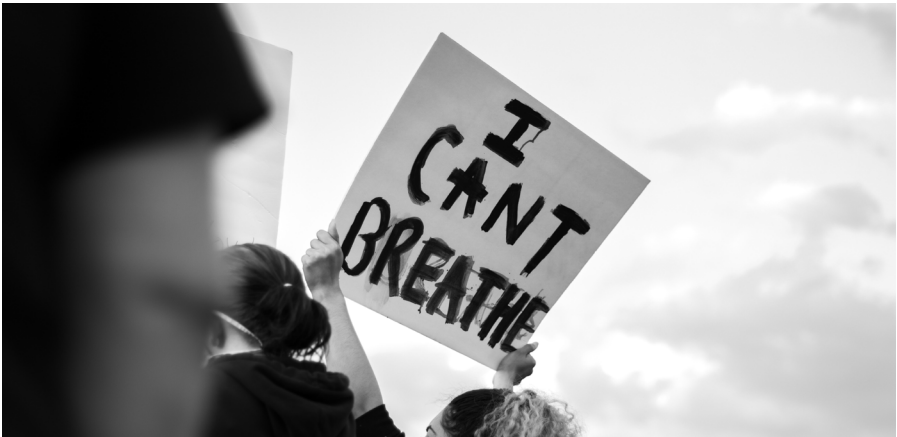
I can't breathe

social position will remain existentially precarious after all, realising that white elite culture "becomes parody on [her] body". 15 Her refusal to undergo medical treatment reflects her indelible awareness of the deeper social and historical reasons underlying her condition – the consequences of colonialism, whose tumerous repercussions would demand a therapy even more complex than the fight against actual cancer's metastasis. The unsettling insight reached in the book is that not only an individual but collective awareness process is necessary, as British society will have to critically engage with its colonial past to work rigorously against racial discrimination with its overlapping oppressions in terms of gender and class. The all-encompassing dimensions of this condition are made clear in the novel's nearly manifest-like final sections, which see everyday racism as