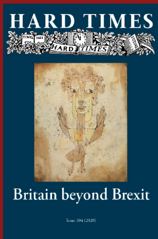
Issue 104 (2020) Britain Beyond Brexit