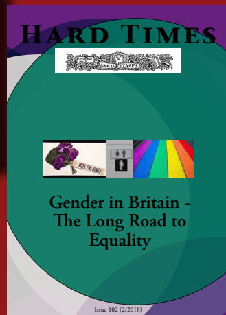
Issue 102 (2/2018) Gender in Britain - The Long Road to Equality

For past digital issues of Hard Times, please visit: