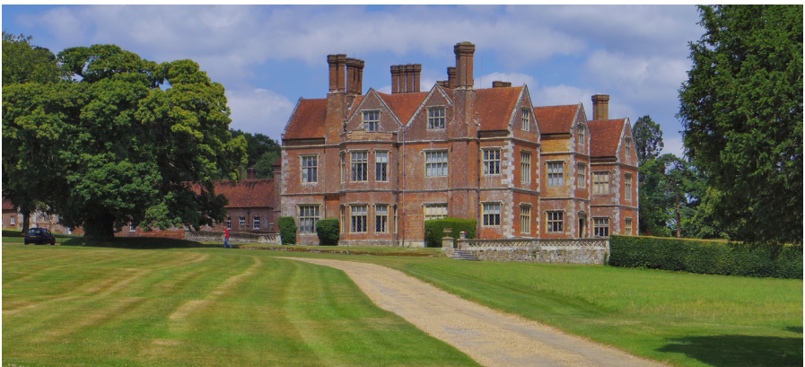
English Country House

The scrutiny of the compromised and questionable assembly of the self might result in a deconstruction of identity, to an alternative assembly from the analysed parts, a new articulation from elements. While such an outlook is manifest in the narrator’s ambiguous wish to “transcend”, it does not simply lead up to an overcoming of her fraught identity in terms of a new subject position. 12 A turning point is reached when the narrator visits a garden party at her boyfriend’s family estate (a classically English and very ‘Woolfian’ locus for societal reflection): leaving the scene and re-entering “from the periphery” 13 , the narrator now becomes more sovereign in controlling