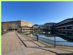
ARCHIVAL VISIT AT KEW IN GREAT BRITAIN