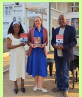
BOOK TALKS IN PORTUGUESE AND GERMAN AT THE CCMA, THE CULTURAL CENTER MOZAMBIQUE- GERMANY