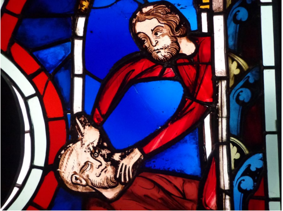
The Blinding of Samson, stained glass window of the Sainte Chapelle, ca. 1245 – Musée de Cluny, Musée National du Moyen Âge, Paris.