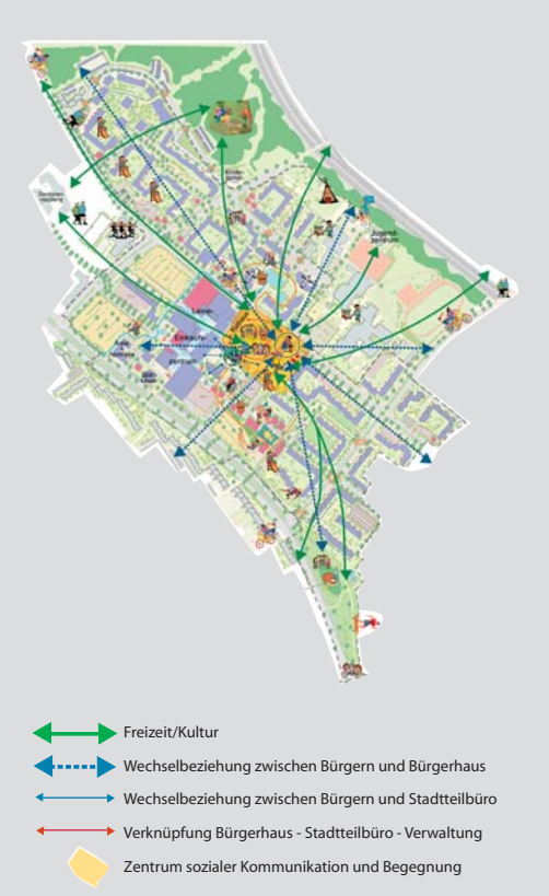
fig. 1: social framework

The City of Laatzen, located south of Hanover, was accepted into the programme in 2004. The University of Potsdam (Department of Geography, Workgroup on Regional Sciences) was assigned for the preparation of the Social Framework and the integrated action plan. Additionally, the university runs a local "quarter office" which carries out expert monitoring tasks. The office staff is working to assure, promote and develop Laatzen-Mitte's still stable living conditions by transforming scientific approaches into practical efforts and measures. In this process, the social framework and integrated action plan are used as fundamental guidelines for the socio-economic, structural and cultural development of the research area