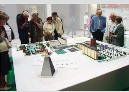
fig. 2: Ausstellung Ideenspiegel

Considering this, a number of social and urbanistic projects were realised and funds were raised. For instance, the rearrangement of the Leine-Vorplatz was started. Besides, citizen workgroups were formed; they realise small projects, and their ideas and suggestions are taken into account in the planning process (fig. 2). At present, numerous microprojects are being run in the context of the promotional programme "Stärken vor Ort" ("Strengths on Site"). Their aim is the occupational integration of disadvantaged young person and the occupational re-entry of women.