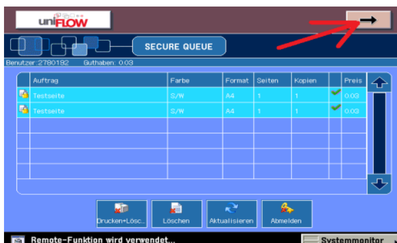
Figure 1: Printer touchscreen

If you have followed the instructions from the link and sent your documents to be printed you'll have to go to any printer with your PUCK. Next to each printer you should see a small card reader, where you have to insert the PUCK. Then you should see your balance on the screen of the card reader and on the touchscreen of the printer you should see something like in Figure 1. The printer will show you all documents you sent it to print. You can delete selected documents with Löschen . With Drucken+Löschen all documents are printed and then deleted from the queue. The green checkmark next to each document tells you whether you have enough money on your PUCK to print.