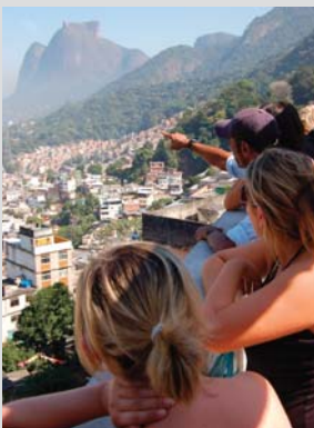
Tourists marvelling at the view over the favela Rocinha in Rio.

It is estimated that 300.000 tourists visit the townships of Cape Town per year. What started as a niche market for travellers with special political interests, eager to see the sites of the liberation struggle against Apartheid, has now become a mass phenomenon. About 40-50 companies operate tours through various townships of Cape Town.