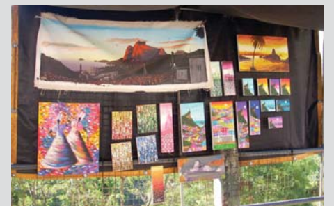
Memories for tourists in Rio: Photo: M. Rolfes

Despite these similarities, the basic characteristics of the quarters that are demonstrated vary: In Cape Town tour guides focus on historical, political, and cultural categories, which is a result of the ethnically segregated development of South African cities under Apartheid. In favela tourism basic elements are the good provision of infrastructure, and themes of violence, crime, and drug traffic. Slum tours in Mumbai are strongly and formatively influenced by an orientation on the economic activities of the community.