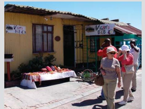
Vicky's Bed & Breakfast in Khayelitsha, Cape Town.

Thus, on the one hand, tourists are curious to see what they are shown or meant to be shown and, on the other hand, mixed feelings and a certain sense of guilt also occur in individual cases.